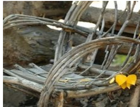
Bent Willow Furniture