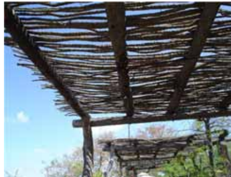
Rustic Shade Arbor