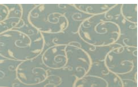
Cabaret Blue Haze