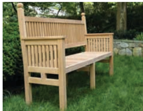
English Garden Bench