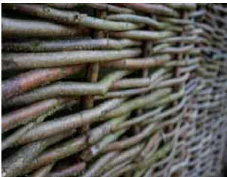
Wattle Edging & Panels